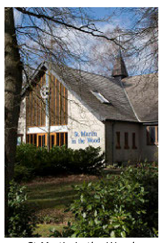
St Martin in the Wood