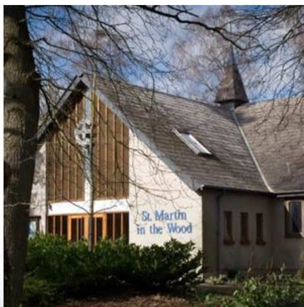
St Martin in the Wood